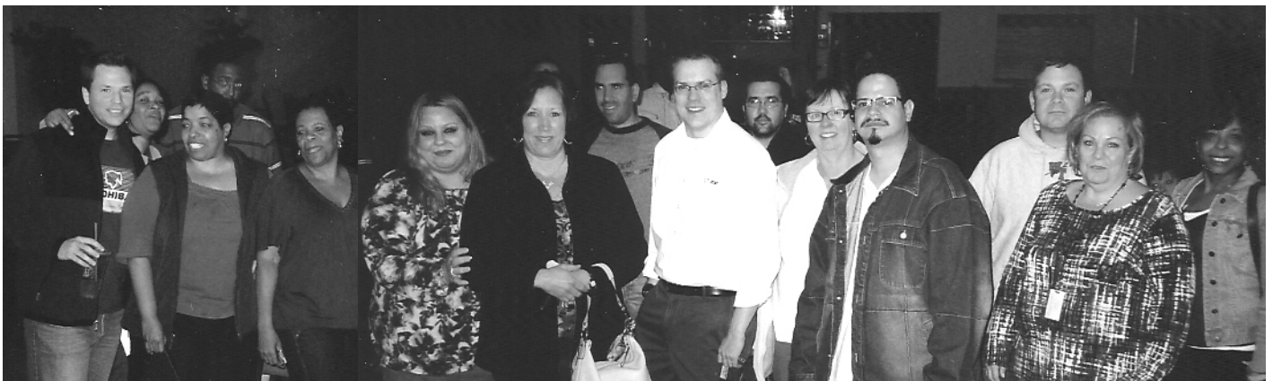
Stewards Meeting, April 14, 2010

The reality is that the executives and politicians decide the fate of their companies and their states, not unions. It is the top leadership that sets policy. It is the workers who follow that policy. Win or lose, sink or swim the fact is the worker has little control over the destiny of the company or the state. NJ didn't get into a financial crisis overnight, it happened over decades of both Democratic and Republican rule. Verizon didn't find itself in a competitive environment overnight and the executives should have planned better for how to respond to the emerging threats. Chris Christie, Ivan Seidenberg and the rest of them should remember that when you point the finger of blame, there's four fingers pointing back at you.