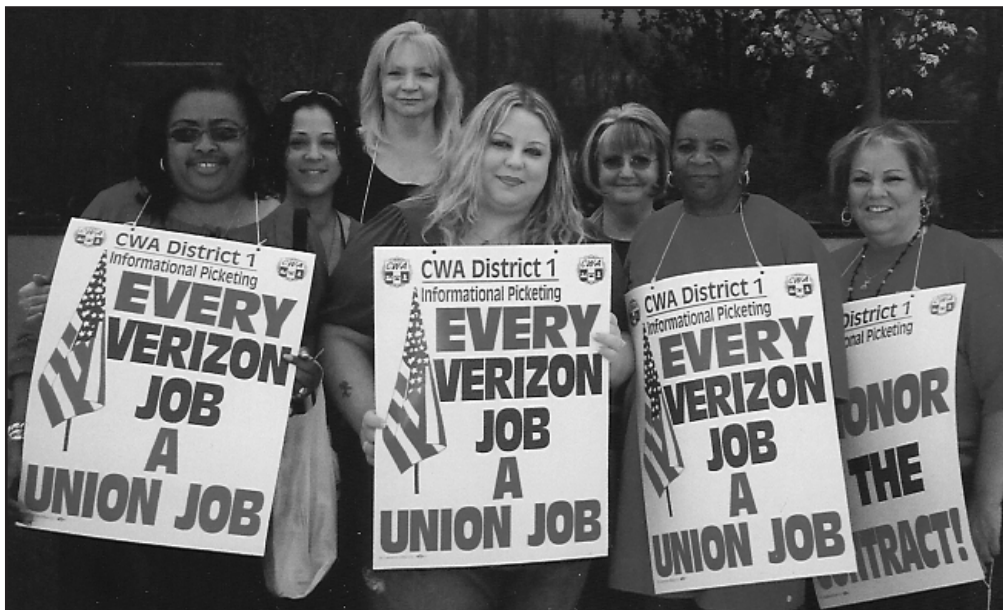
On Thursday, April 8th, CWA members picketed the Livingston building to protest the onsite training of newly hired non-union workers while union workers are being surplused.

It is important to know that anyone taking this package is not entitled to collect unemployment.